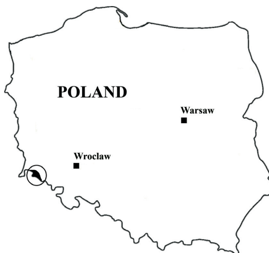
Fig. 1. Localization of Iżera Mountains

The study was carried out in the Iżera Mountains (the Western Sudetes), a mountainous region situated in southwestern Poland (Figure 1) at 50°49'- 50°51' N and 15°18'-15°29' E, with the maximum elevation of 1126 m a.s.l. The Iżera Mountains lie in highland climatic regions with the longest winter duration of 110 days and snow cover duration of 116 days. The westerly and northerly Atlantic wet winds contribute to a high level of precipitation and wetness. The average air temperature is -5°C in January and 13°C in July, while the average annual precipitation is 1500 mm. The vegetation growth period lasts 175 days and starts in late April (MIGOŃ et al. 2003). The Iżera Mountains are crisscrossed by valleys of several rivers and creeks.